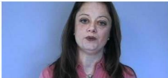
Executive Resume Writing Services & Fees